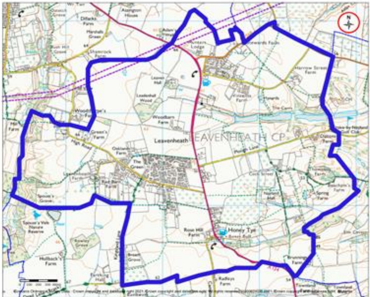
Figure 1: the Leavenheath parish, designated Neighbourhood Plan area. Blue line denotes parish boundary and purple dashed line denotes pylons and power network.